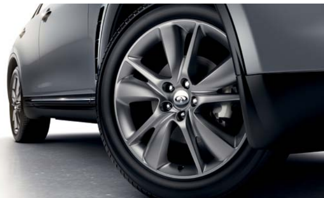
20 X 8.0-INCH LIGHTWEIGHT ALUMINUM-ALLOY WHEELS