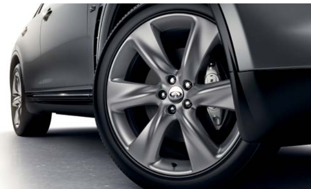
21 X 9.5-INCH LIGHTWEIGHT ALUMINUM-ALLOY WHEELS

Always wear your seat belt, and please don't drink and drive.